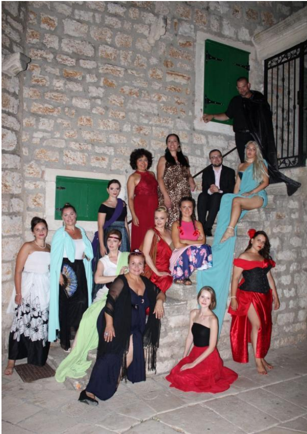
After the performance Opera Fragments, Jelsa, Croatia 2024