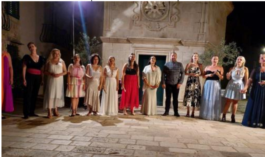
Concert Popular Opera Melodies, Jelsa, Croatia 2024