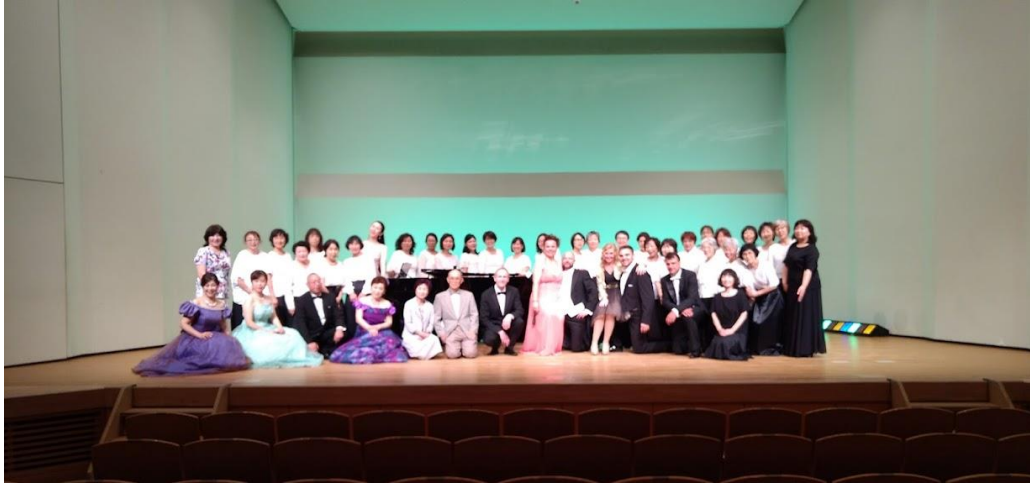
Workshop Fukushima - the Final concert Japan 2018