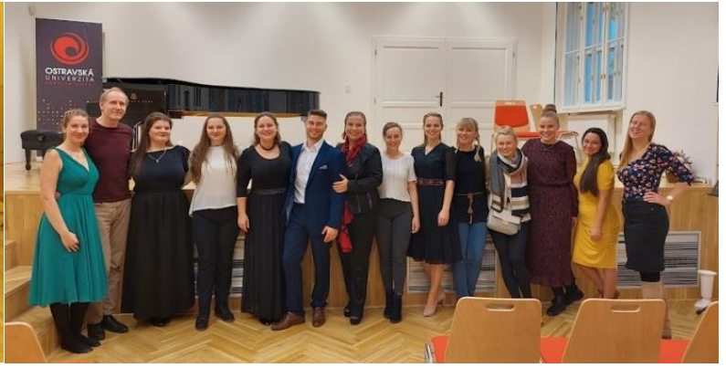
Workshop UNI of Ostrava , Czech Republic 2022