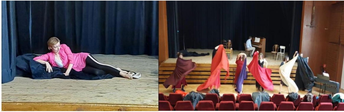
Devín, Slovakia 2023