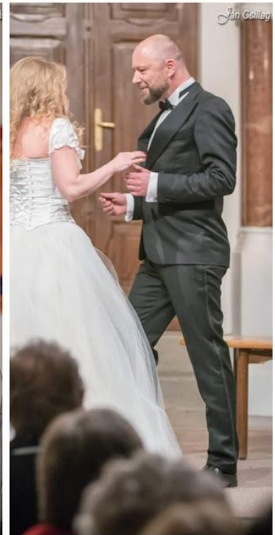
Don Giovanni – Japan 2016