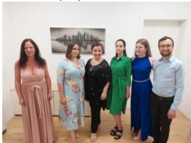
Concert of Slovak songs, Vrbanj, Croatia 2022