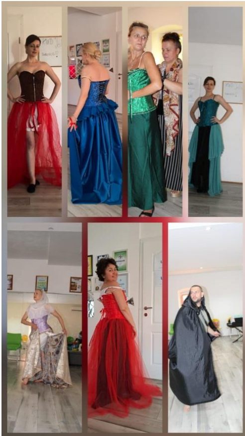
Costume preparation, Jelsa 2025