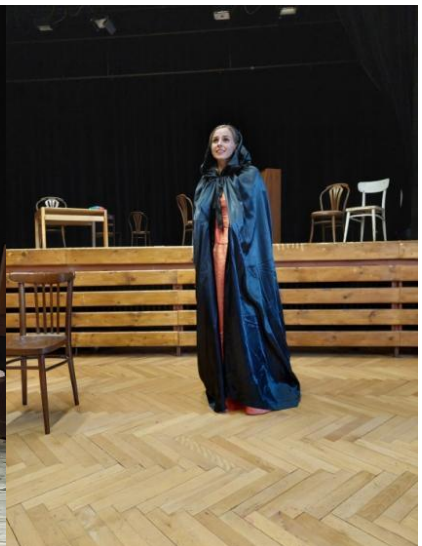
Devín, Slovakia 2023