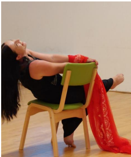
Workshop Hvar, Croatia 2023