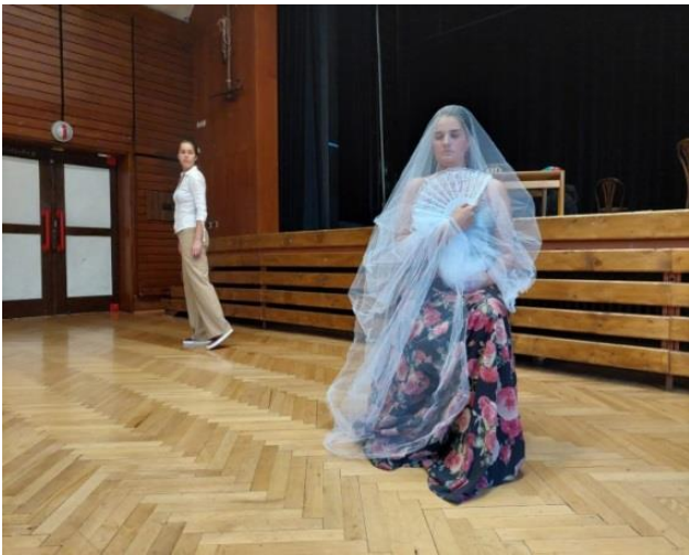
Master Classes Devín, Slovakia 2023