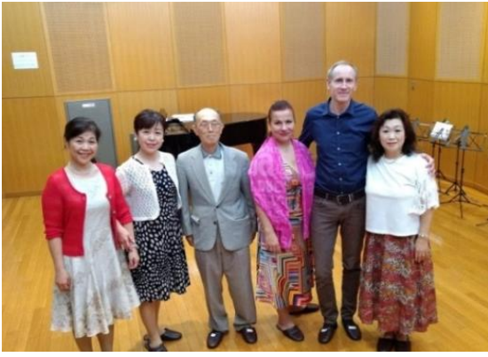
Workshop Opera Operetta Fukushima, Japan 2018