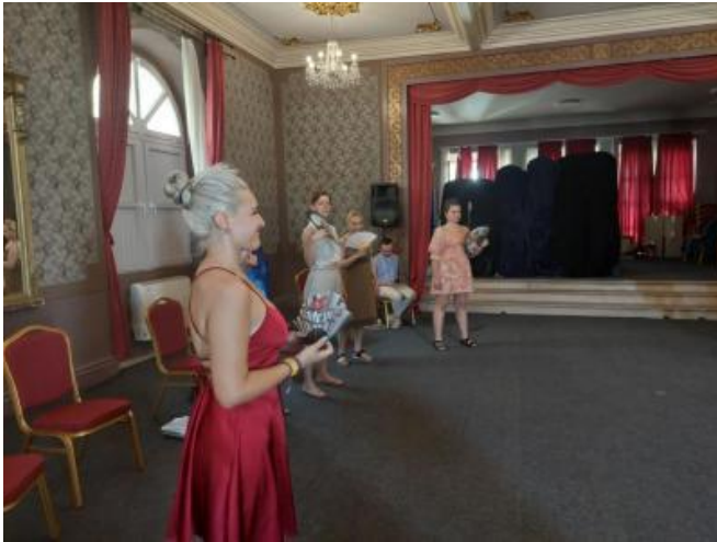
Creating the dramatic character, Jelsa 2024